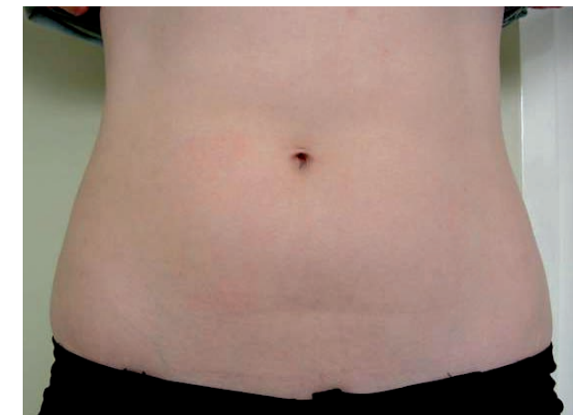
AFTER Diamond Contours Biomesosculpture treatments